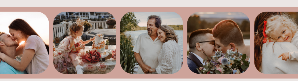
"capturing your vision of the world"